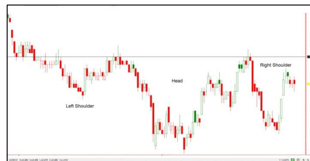
Figure 3.2: Inverse head and shoulders

It is also observed that an inverse head and shoulder pattern is also forming and a breakout of the $0.715 neckline price level with a convincing volume to complete this formation. The target price of the formation would be $0.85.