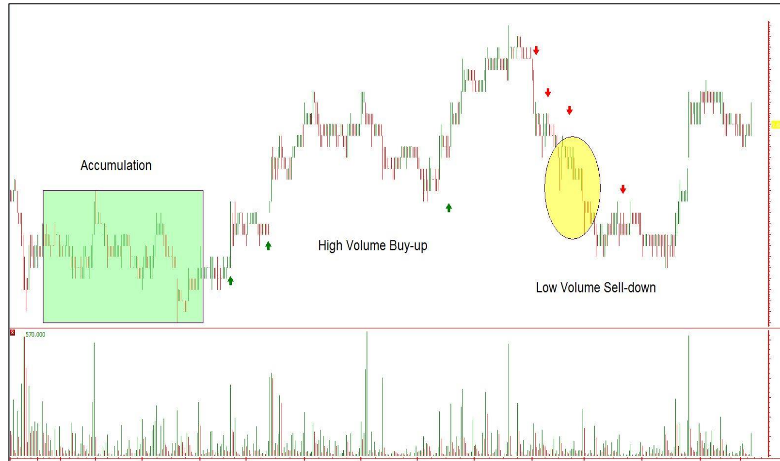
Figure 3.3: 60mins chart showing high volume buy-up and low volume sell-down

In recent weeks, a moving average crossover was observed on 14 th November 2014, indicating that the market has turned bullish for Yoma Strategic Holdings.