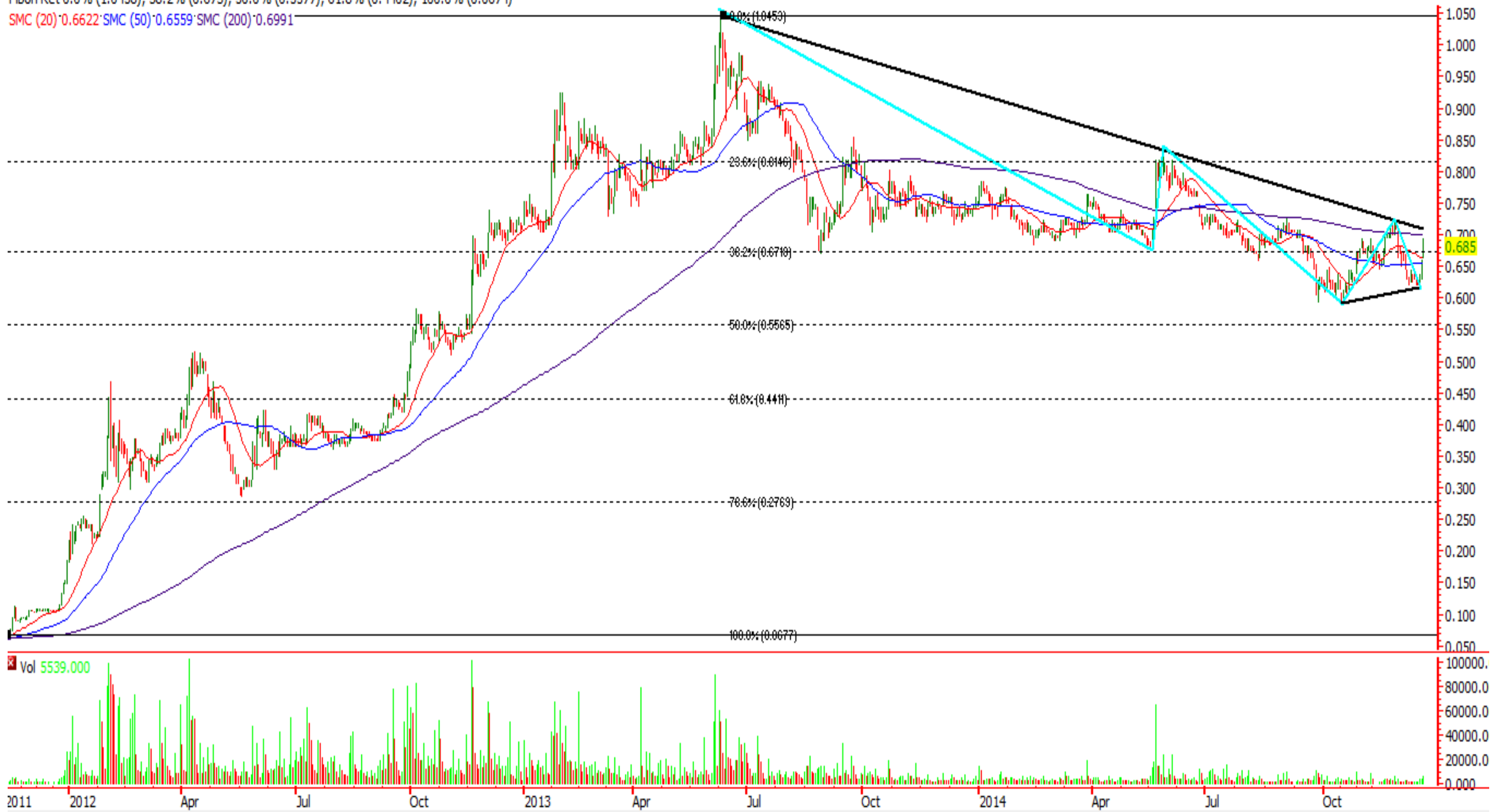
Figure 3.1: A daily chart of Yoma Strategic featuring Moving Averages, Trend Lines, Volume and Elliot Waves count.

SMC (20) 0.6622 SMC (50) 0.6559 SMC (200) 0.6991