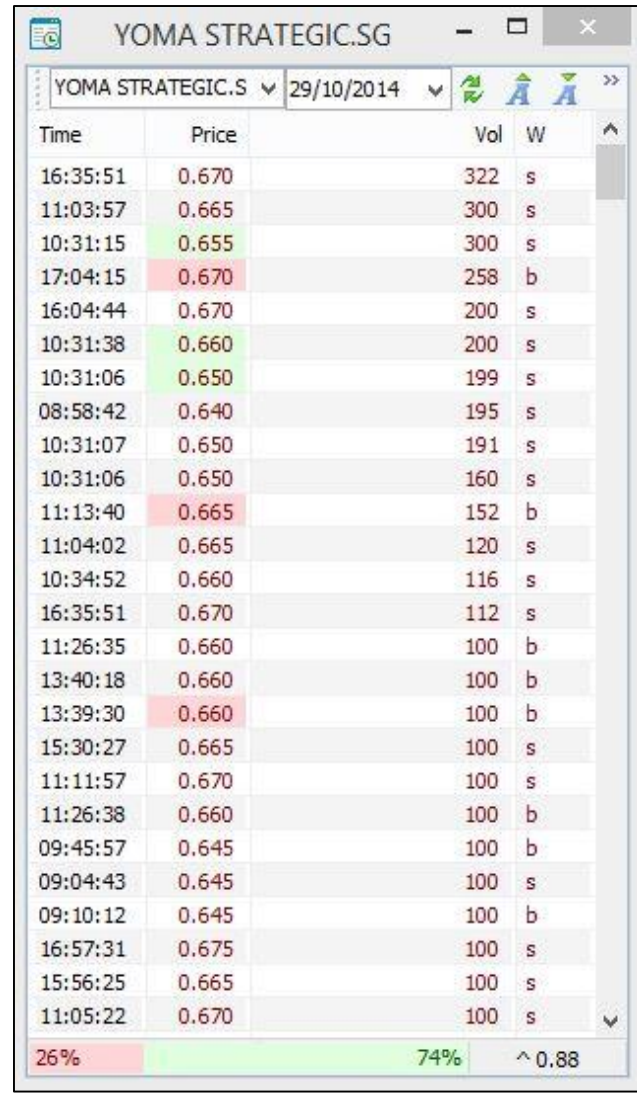
Figure 3.5: Time and Sales at 29/10/2014

From the above time and sales table, it further emphasises our view that there is strong signs of accumulation of Yoma Strategic.