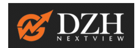
Chart Data by: